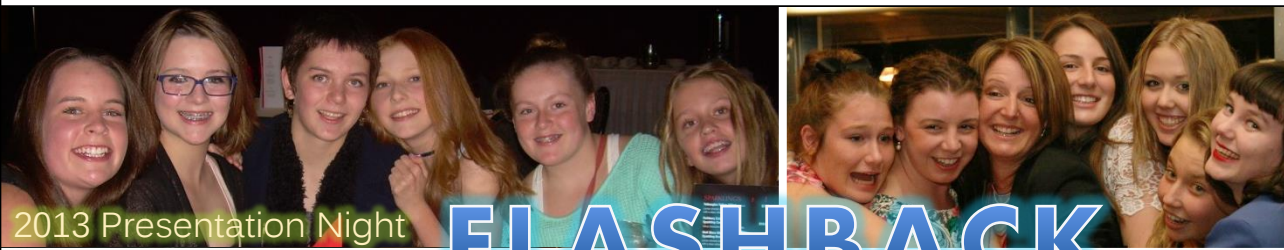
2013 Presentation Night

* Ladder after round 2 (round 3 results not entered yet)